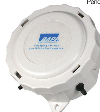
Zone Pressure Transmitter