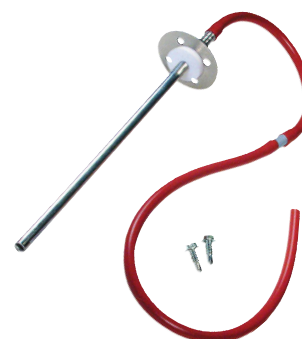
Optional Static Pressure Probe Assembly

BAPI's Zone Pressure Transmitter is an accurate, rugged and economical solution for measuring and reporting duct/building static pressure, room-to-room differential pressure or air velocities/volumes. The heart of the unit is a micro-machined silicon piezoresistive pressure sensor specifically developed for low pressure. The sensor receives a five-point error correction over the compensated temperature range for excellent accuracy, repeatability and stability.